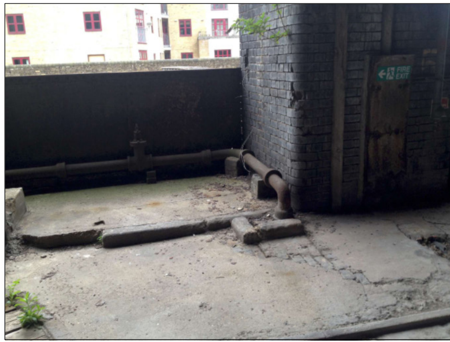
EXAMPLES OF VARIATION IN FLOOR LEVEL AND FINISH - Existing condition to be excavated/filled to facilitate level access to all areas from London Road.